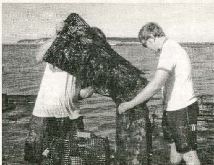
Responsible shellfish farmers routinely visit their site to check on their shellfish and maintain the gear and markers.

In general, to win a lawsuit based on strict product liability, the injured party must prove that the product was defective and unreasonably dangerous when it left the defendant's control and that the defect caused the plaintiff's injury. Strict liability is rarely successful in food-borne illness and injury cases. Very few foods are risk-free and many contain natural occurring bacteria and other hazards like