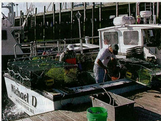
Fig. 1. Lobster traps being loaded on boat.

To assess the efficacy of integrating small-scale oyster culture in lobster traps, a two year study was initiated that enlisted the cooperation of eleven commercial lobstermen from Massachusetts (USA); six lobstermen trapped lobsters