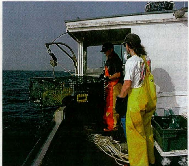
Fig. 3. Modified lobster traps were fished and maintained by lobstermen.

living oysters and length of oysters were determined for each trap at harvest.