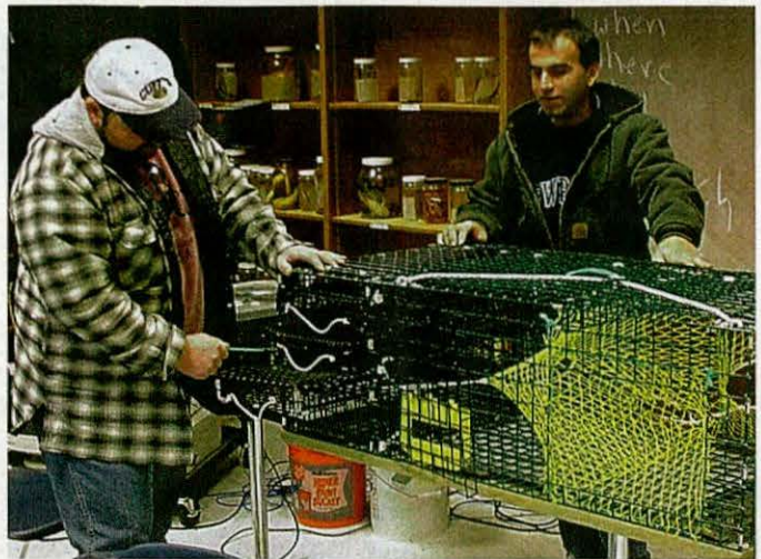
Fig. 2. Lobster traps were modified to hold five trays of oysters integrating suggestions provided by commercial lobstermen.

During both 2001 and 2002, control sites were established north of Boston (Smith Pool, Cat Cove Marine Laboratory, Salem; 42°31.80'N, 70°52.32'W) and south of Boston (Massachusetts Maritime Academy, Buzzards Bay; 41°44.20'N, 70°37.36'W). Oysters were placed in one modified lobster trap at each control site as well as in trays suspended in the water at the Smith Pool site. In 2002, a temperature sensor was secured to traps at both control sites. Traps and oysters were monitored throughout the study period. Number of