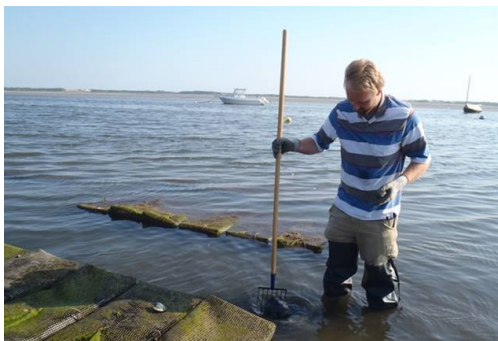
Extension agent collects shellfish samples in Barnstable Harbor.

“When it comes to helping municipalities reach their nitrogen reduction goals, shellfish have a big appeal because they’re a cheaper alternative than wastewater treatment systems or any type of sewerage, and results can be seen faster.”