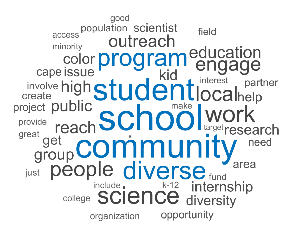
Figure 2. Word cloud for the open response survey question that asked "Do you have ideas on how WHSG can engage in work that advances diversity, equity, and inclusion in marine sciences in Massachusetts?".

Ideas about communications and outreach were also requested, and responses were received with suggestions for outlets and efforts that will help the Communications staff better tell the stories and successes emanating from the program. Examples include radio and local access television, two areas where the program has not traditionally been active.