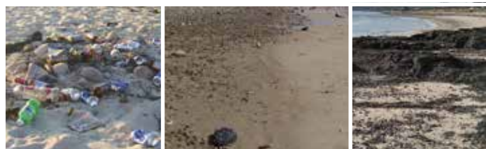
Left to right: trash/marine debris, rocks, seaweed/wrack.

Tractors that pull mechanical beach rakes will have tires that would affect the beach in a similar fashion, in addition to the rake tines which can extend >6" below the beach surface. Mechanical raking is one of the most destructive forms of human actions to beach vegetation. According to a New Jersey study (Kelly, 2014) mechanical raking removes more (-99%) beach vegetation than ORV use (-86%) or even beach scraping (-91%). This is particularly concerning as coastal plants reduce wave height, provide wildlife habitat, the roots reduce erosion, and reduce storm surge by absorbing water, then slowly releasing it.