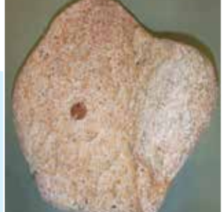
> 256mm Boulder