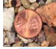
2 – 15mm Fine Gravel