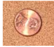
0.0625 – 0.125 mm Very Fine Sand