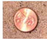
0.25 – .05mm Medium Sand