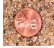
1.0 – 2.0mm Very Coarse Sand