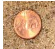
0.5 – 1.0mm Coarse Sand