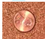
0.125 – .025mm Fine Sand