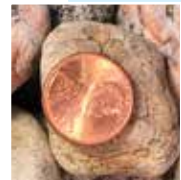
15 – 64mm Coarse Gravel

of Massachusetts they have a relatively low (typically <10%) shell content, compared to other states (i.e. some Florida beaches have > 90% shell). While shell fragments are considered sediment, and may fit within the size classification of sand, they typically deteriorate more quickly.