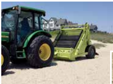
A mechanical sand rake being pulled behind a tractor, along with the tracks made by this system.

such as Duxbury Beach, require that the ORV drive at least 20 feet from the base of dune or vegetation line to protect the fragile root system (rhizomes).