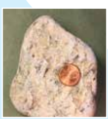
64 – 256mm Cobble

Removing the large size particles (coarse gravel and cobbles) from the beach can reduce the level of storm damage protection. Also, this removal effectively reduces the grain size of the beach which may allow for more rapid erosion (even during non-storm conditions) of the remaining sediment and therefore make the beach more costly to maintain. Nourishing a beach with material that is slightly coarser than existing condi-