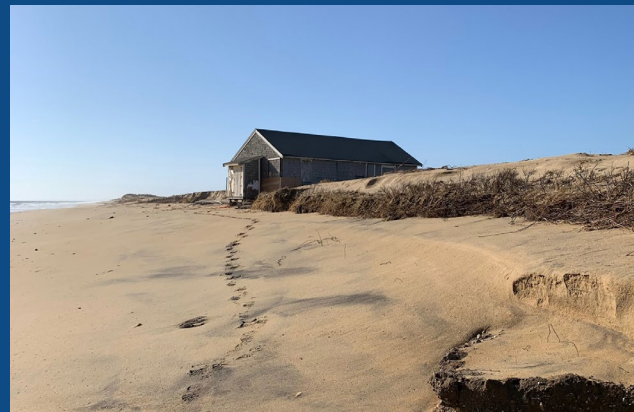
Structures Damaged December 2023