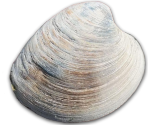
Native Northern Quahog ( Mercenaria mercenaria )