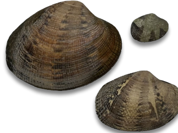
Manila Clam ( Ruditapes philippinarum )